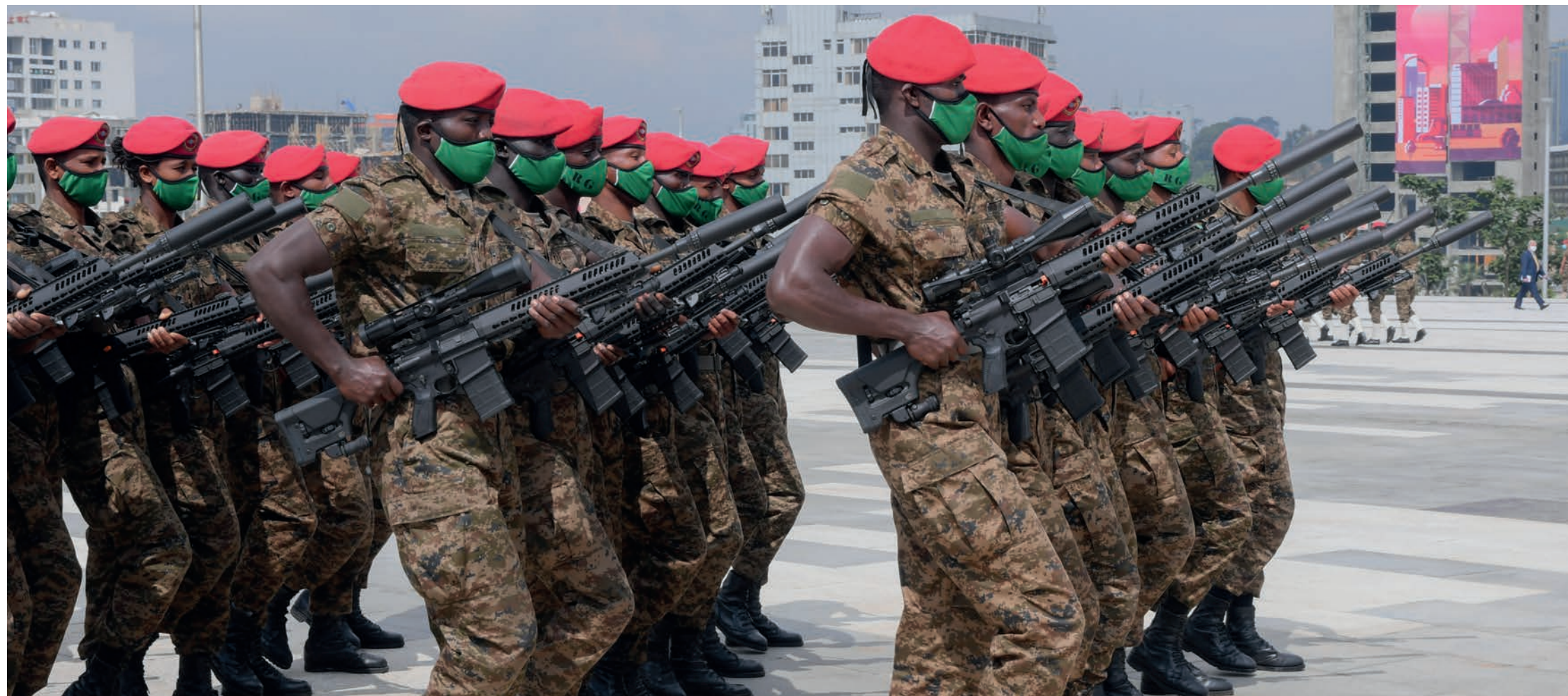
The Ethiopian National Defence Force conducts exercises during a military parade in Addis Ababa

HD maintained watching briefs in the electoral hotspots of Puntland, Galmudug and South West and convened two roundtable meetings with international stakeholders to share analysis and explore responses to the electoral crisis.