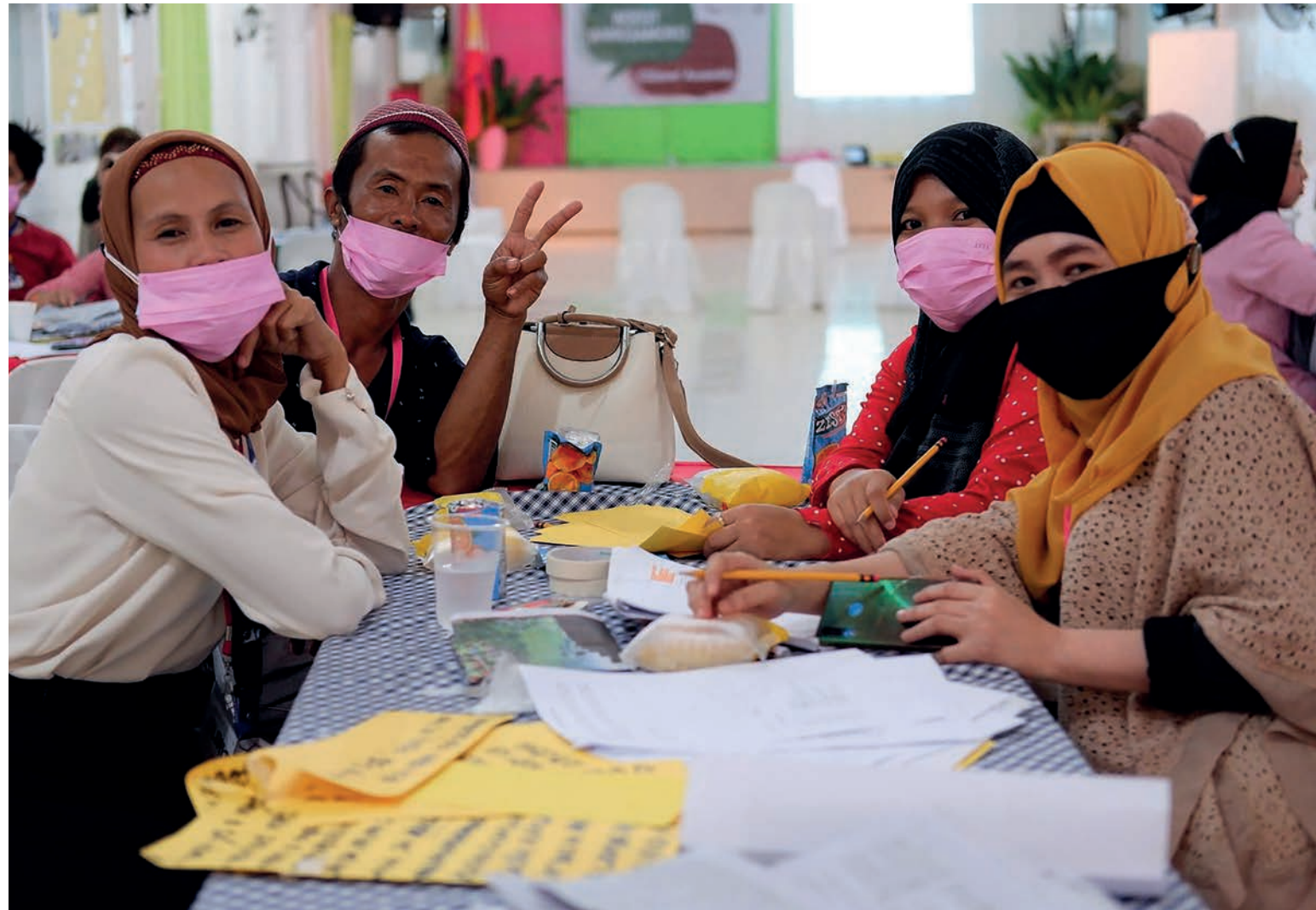
Citizen assembly session in Mindanao in the southern Philippines

HD initiated dialogue among Asian experts on the Korean Peninsula to look beyond deadlocked issues of nuclear disarmament and explore wider questions of human security.