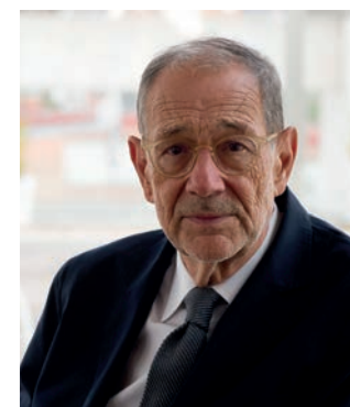
Dr Javier Solana