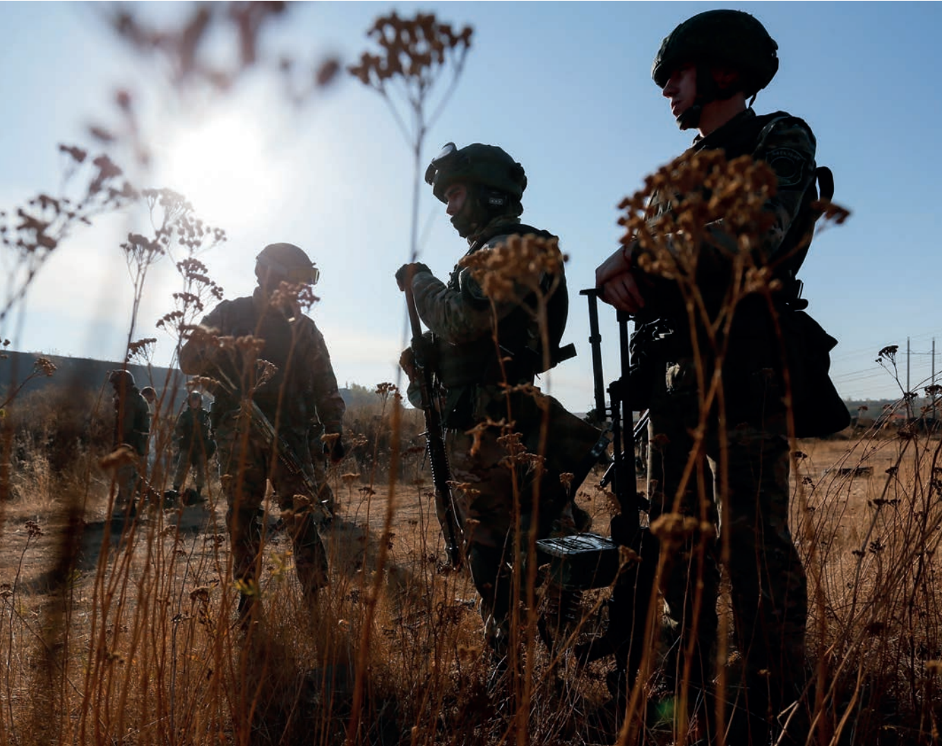
Pro-Russian fighters from the self-proclaimed Donetsk People's Republic attend a tactical exercise