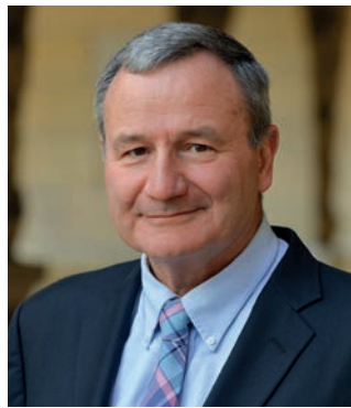
Ambassador Karl Eikenberry