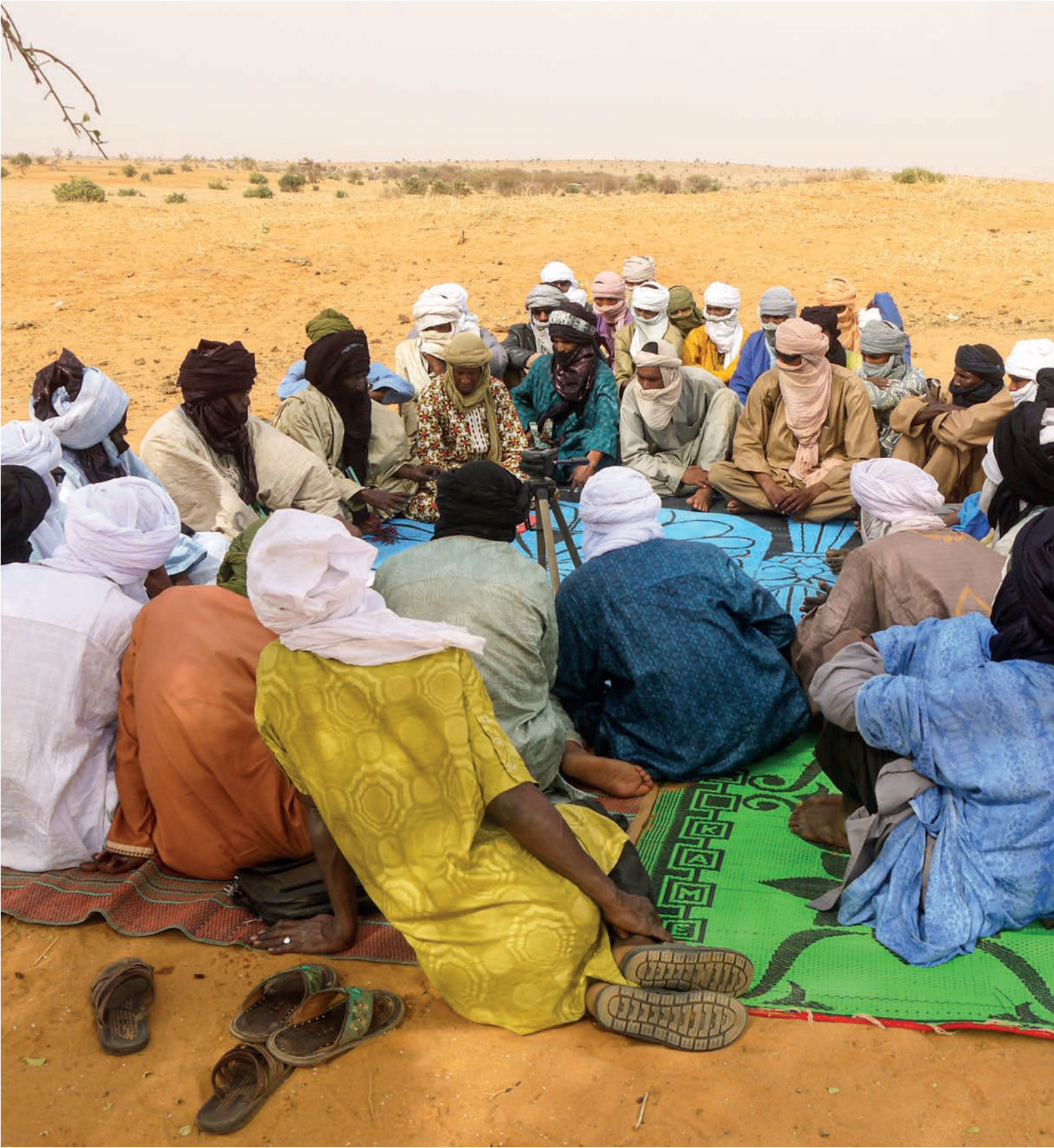
Community dialogue in Chad

In Niger , under a mandate from the Haute Autorité à la Consolidation de la Paix, HD supported a plan for stabilisation of the Diffa region bordering Nigeria that has suffered severely from Boko Haram attacks. HD's work concentrates on helping communal peace committees and authorities ease tensions and conduct local transitional justice processes for the return and reintegration of former rebel fighters.