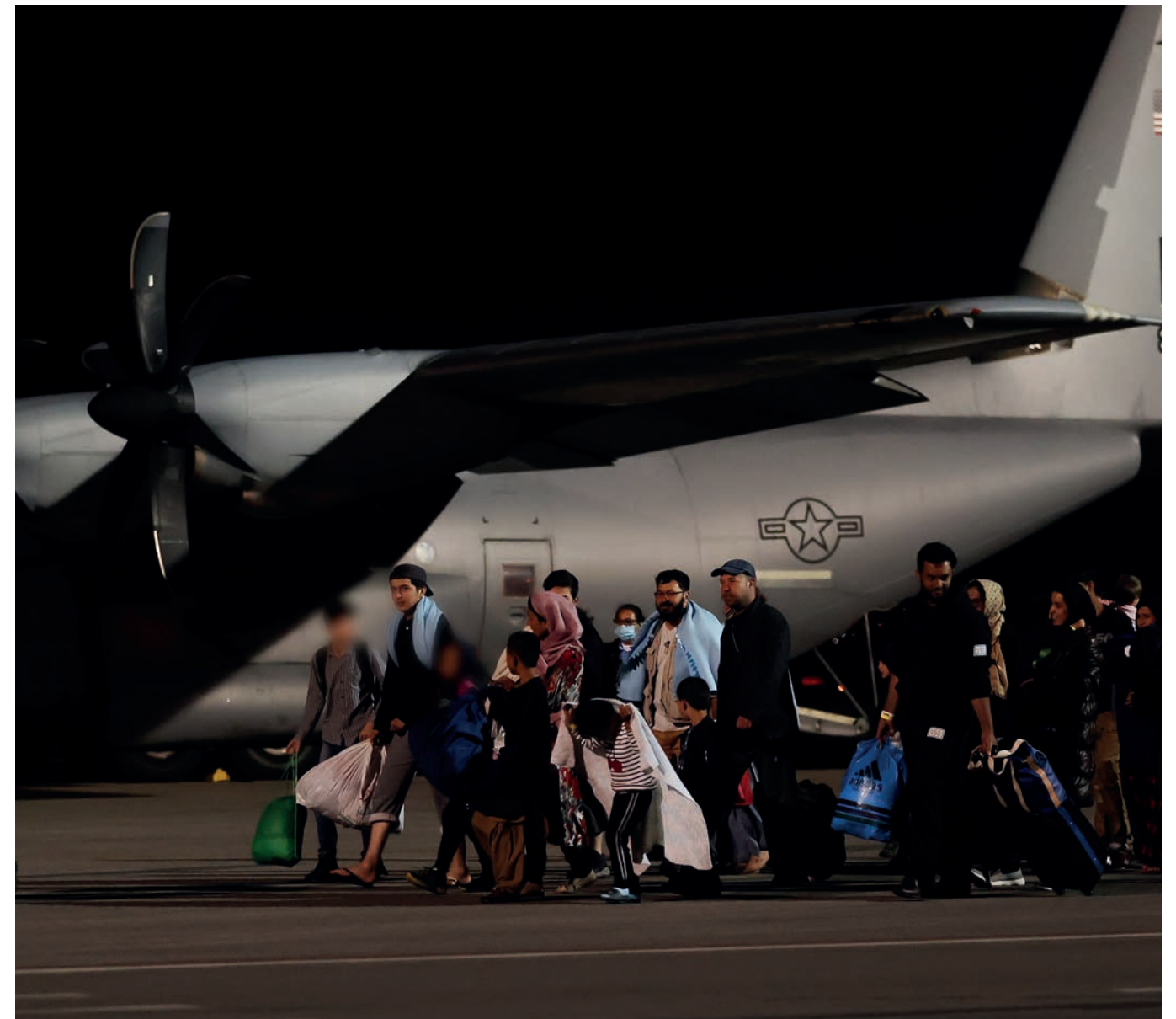
Afghan evacuees, who left their country after the Taliban takeover, arrive at Pristina International Airport in Kosovo

Alongside efforts to contain the pandemic, HD maintained existing projects to support vaccination against polio and other diseases in high-risk areas.