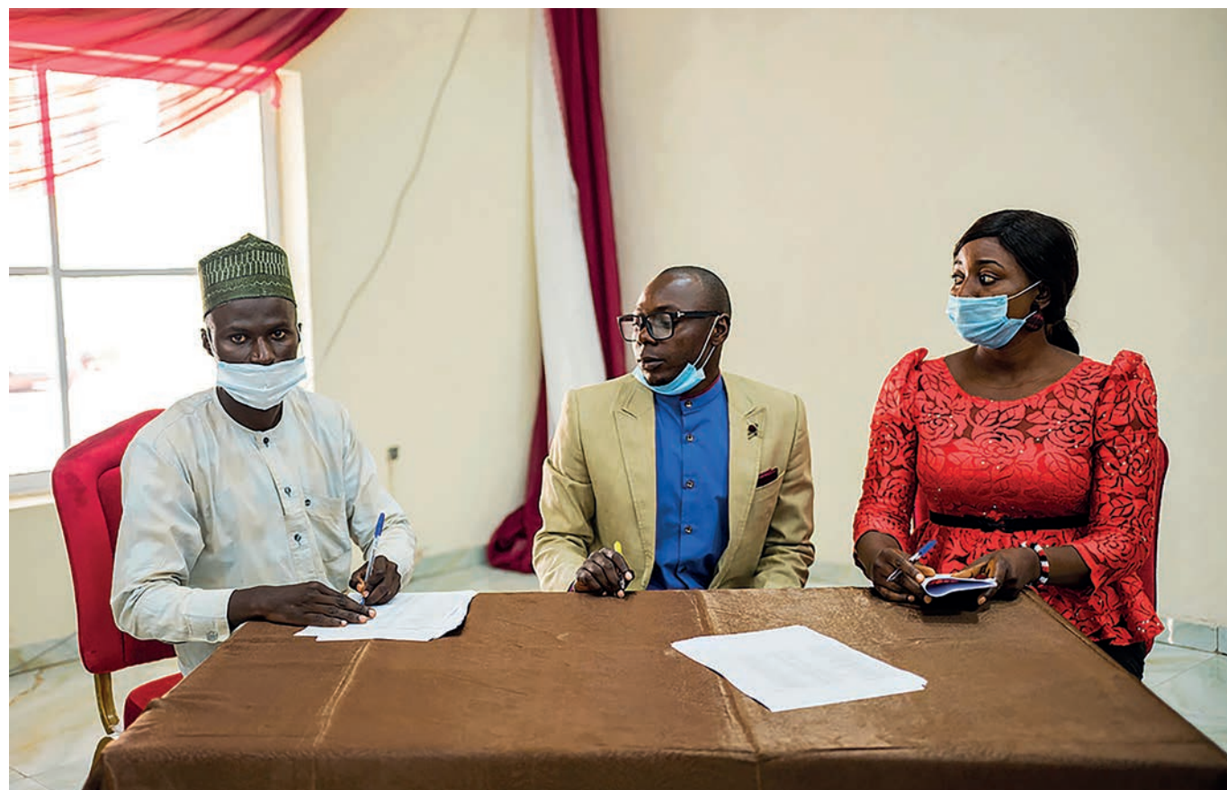
Signing of the landmark social media peace agreement in Nigeria