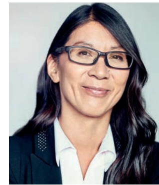
Dr Joanne Liu