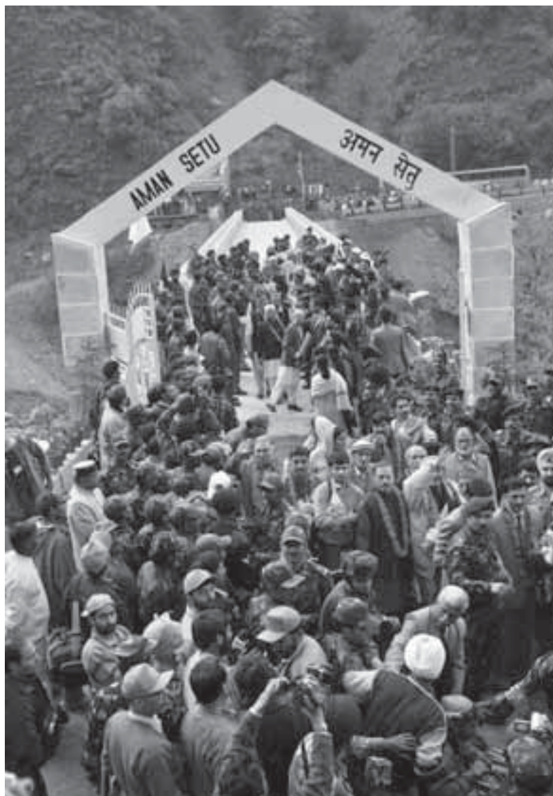
Bus passengers from Pakistan controlled Kashmir, in garlands, cross over the bridge to India, at Kaman Post, near the Line of Control, April 7, 2005.

“You are all the real stakeholders in the future of Kashmir, and it is only through your energetic participation that a New J&K can truly be built. Let this roundtable be remembered as