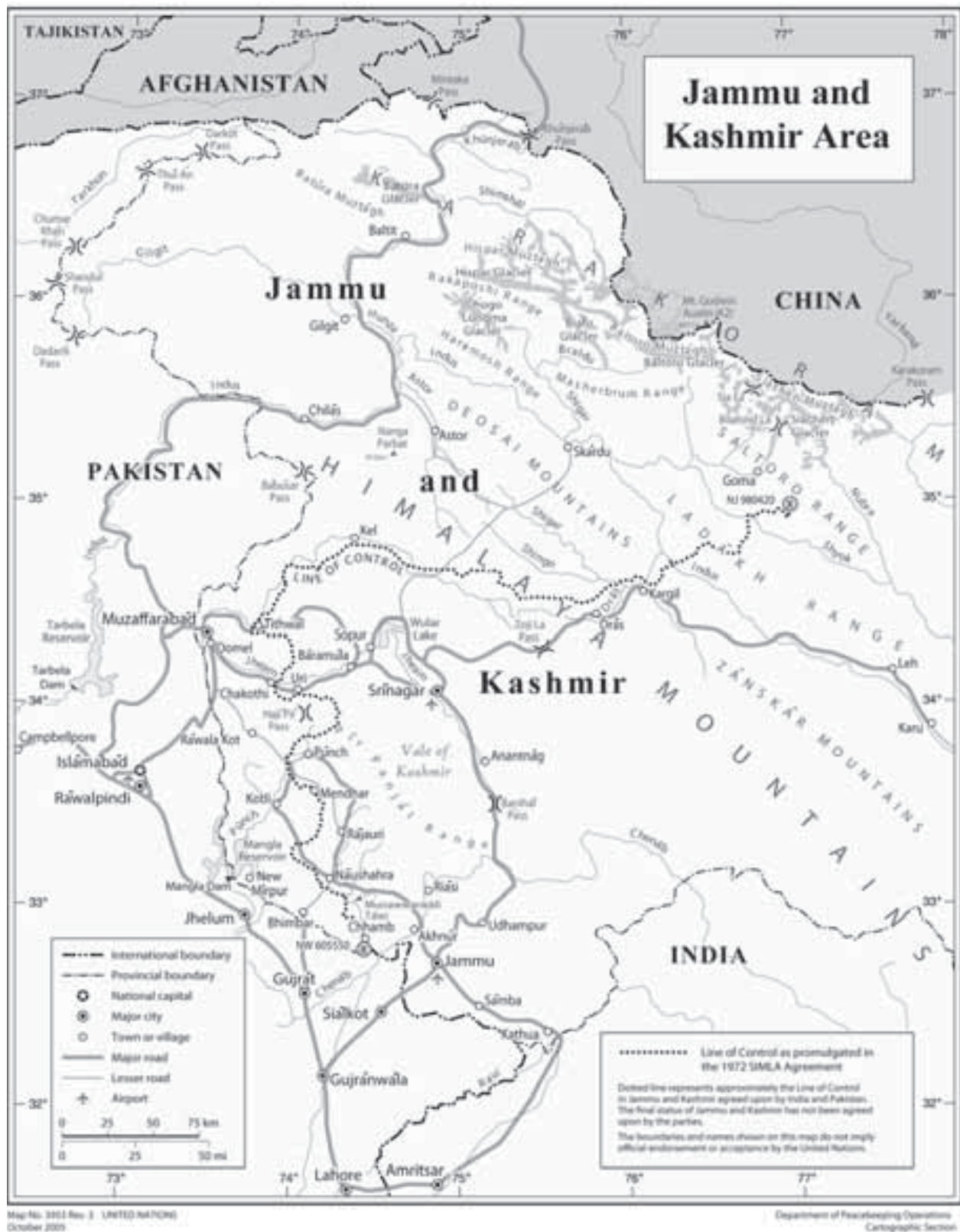
Figure 1: Map of Kashmir