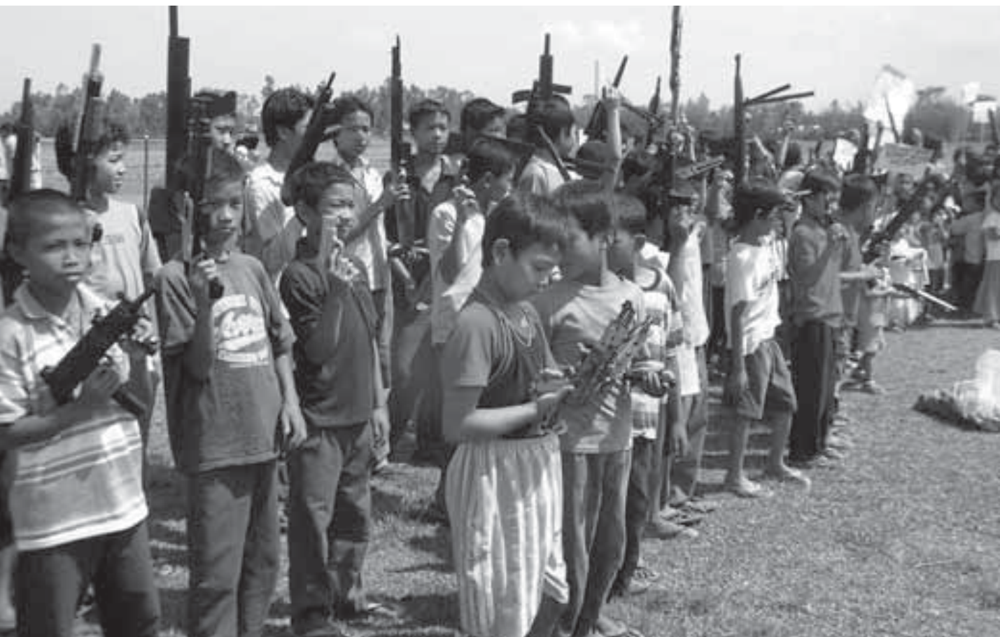
Children hold their toy guns prior to burning them in symbolic protest at Keinou, south of Imphal, May 21, 2008.

lack of commitment by the local political leadership to public welfare, and respect for the rule of law by all entities has diminished alarmingly.