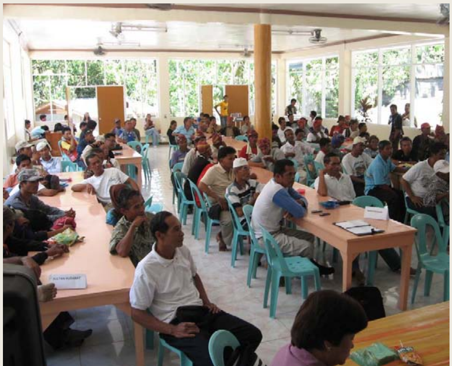
Photo taken during the MILF consultation with Indigenous Peoples community leaders in February 2010 in Crossing Simuay, Sultan Kudarat, Maguindanao. This sectoral consultation was supported and attended by the Mindanao Think Tank.

Some participants added that there are 13 ethno-linguistic groups that are Islamized, and as such fall under the umbrella of the Bangsamoro. However, each has its own dialect, culture, and traditions. According to some participants, their traditional institutions can better deal with a secular Philippine state rather than a religious one. But the Lumads agree that the 13 groups’ assertion of being Bangsamoro means an assertion for self-determination.