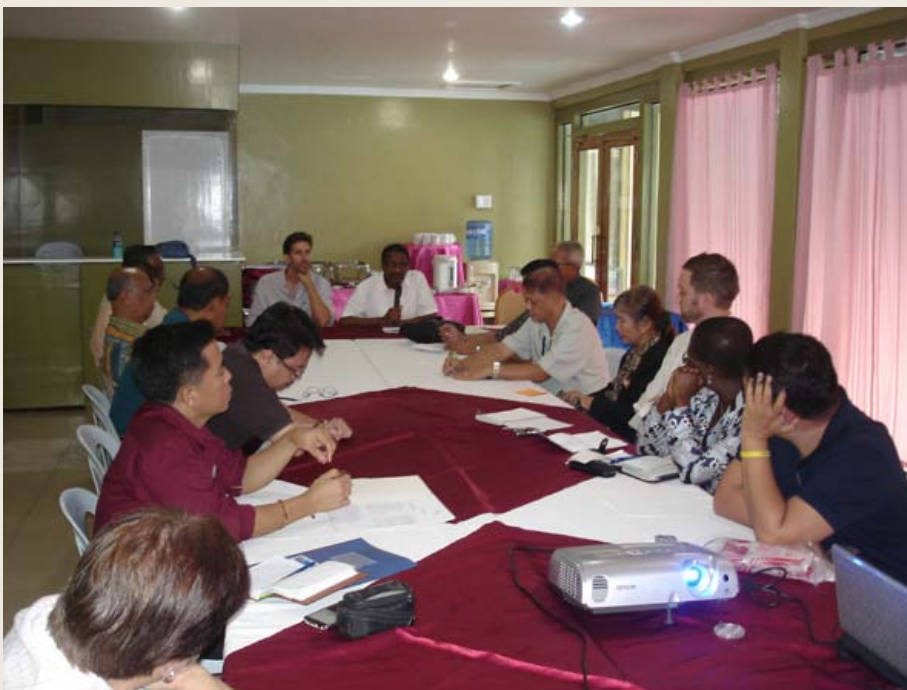
Photo taken during the Mindanao Think Tank workshop and roundtable discussion number 4. Photo shows former Sudanese Ambassador Nureldin Satti (speaking into microphone) addressing the meeting during the first part of this gathering.

The second part of the workshop/RtD was an assessment of the Mindanao Think Tank. This resulted in the following: