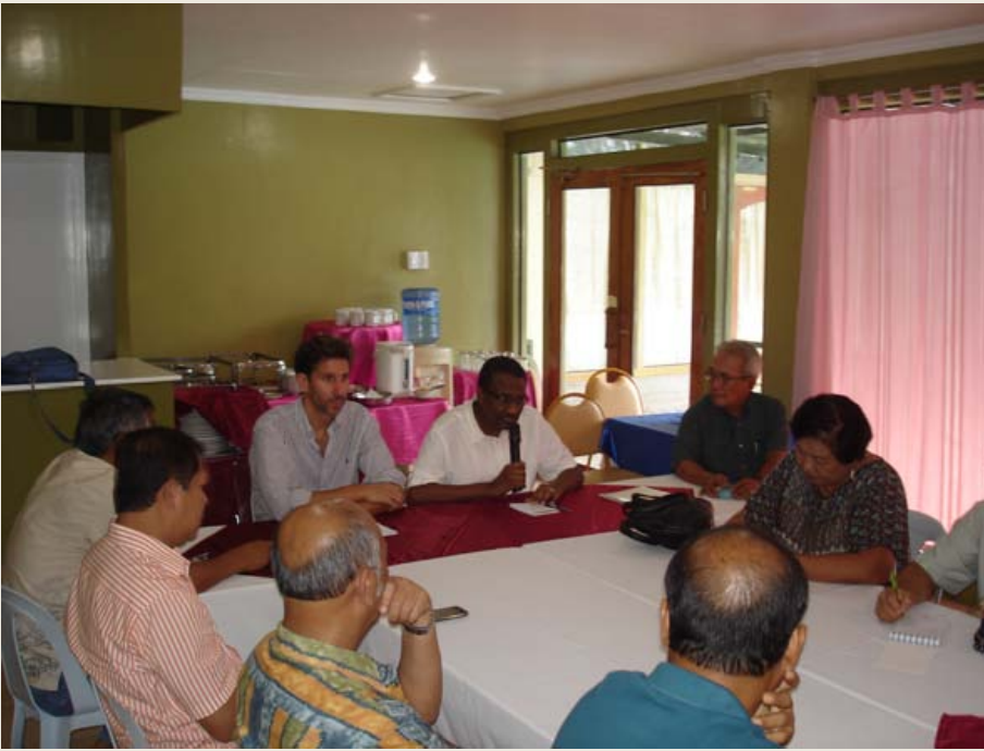
Photo taken during the MTT meeting with Ambassador Nureldin Satti (speaking into microphone).