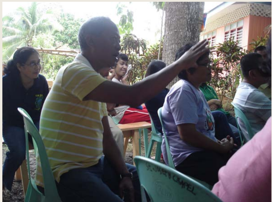
Photo taken during a sectoral consultation with an Agrarian Reform Beneficiary community in April 2010 in Barangay Baluno, Isabela, Basilan. Photo shows one of the community leaders responding to a discussion topic.

An interesting case was an Agrarian Reform beneficiary Community (ARC) comprising entirely of Christian families. Approximately 400 former employees of a corporation that ran a 1,025-hectare rubber plantation benefitted from Government's Comprehensive Agrarian Reform Program (CARP). They now collectively own and run the corporation as one big cooperative-business. For them, they are fortunate that they were awarded an operating enterprise. This is why they are doing the best they can to maximize the plantation's current potential, and even grow it. Unfortunately, the experience of other former big plantations (all are 1,025-hectares in size, part of past Government resettlement and land-use programs) in Basilan are not as good, with many failing and going bankrupt. Some have been portioned-off to their individual beneficiary-families. For the executives of this ARC consulted, Government, whether thru a peace deal or thru other Government initiatives such as support to Agrarian Reform beneficiaries, should do all it can in terms of technical, financial and marketing support to make these plantations once again successful.