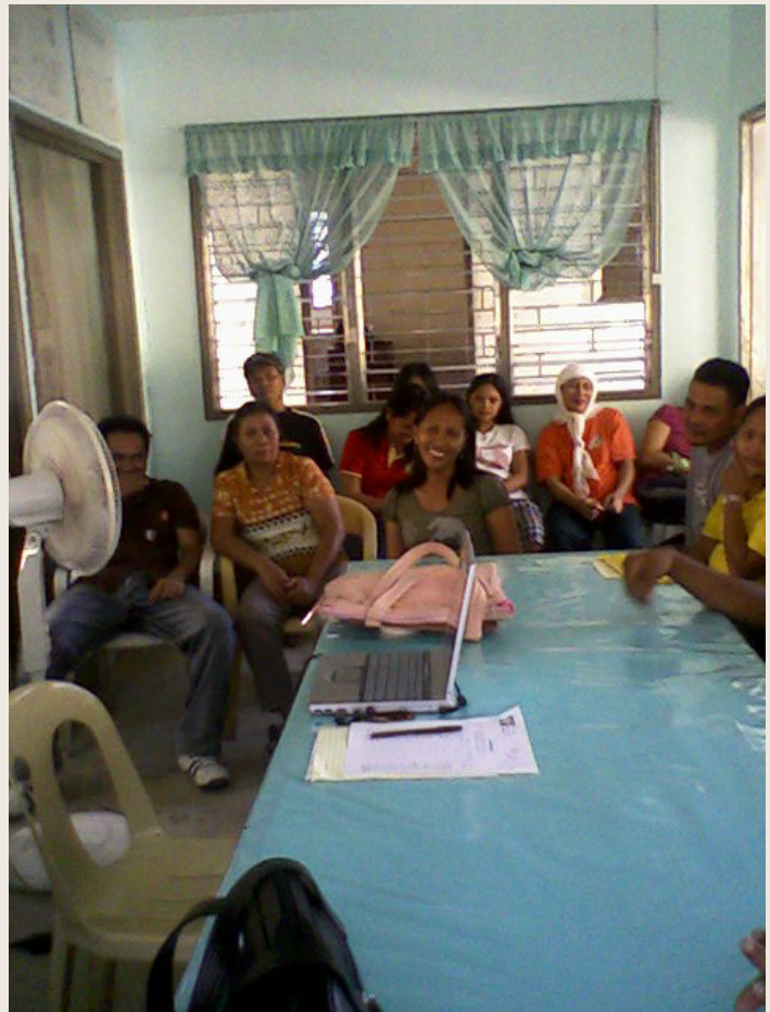
Photo taken during a Christian community consultation in December 2009 in Barangay Rosary Heights 9, Cotabato City.

For the Agrarian Reform beneficiary Community (ARC), since their location is in Category A, they were concerned that if they become part of the Moro Homeland, that their ARC status would be changed. For them, the tenurial status of their land is perfectly legal, except that it is not an instrument governing individual ownership, but communal ownership. They added that important details such as this should be clearly stipulated in drafts of any peace deal, and made know to the MILF so that their people do not go on murderous rampages similar to those they did in 2008 after the fall of the MOA-AD.