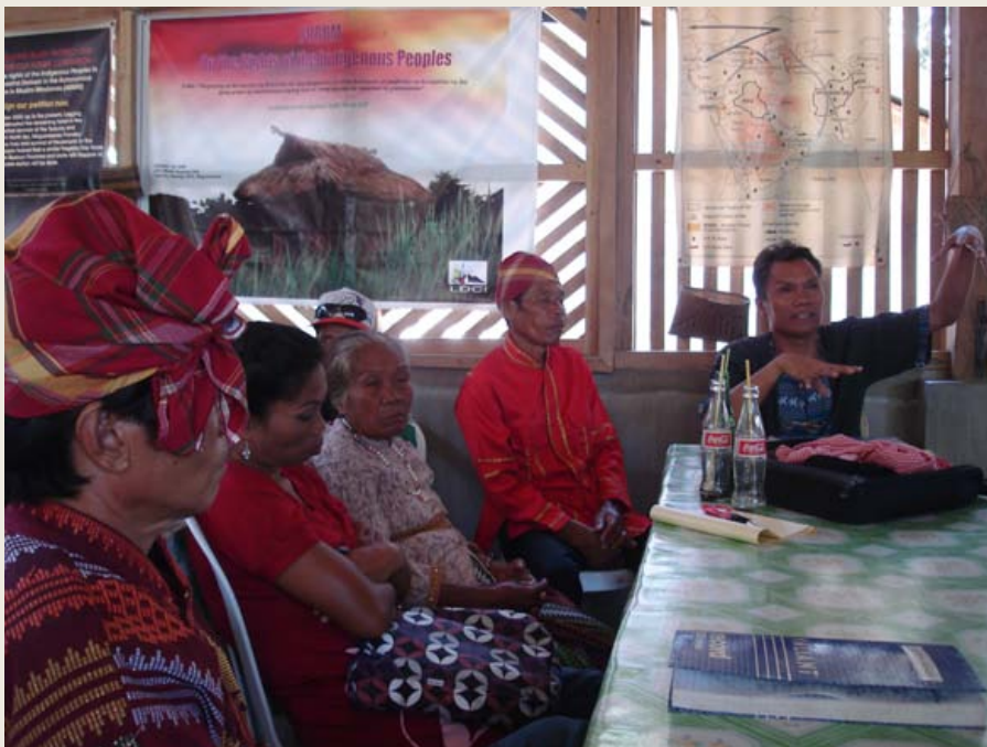
Photo taken during a Lumad community consultation in March 2010 in Barangay Tenorio, Datu Odin Sinsuat, Maguindanao. Photo shows one of the community leaders responding to a discussion topic.

An immediate concern encountered by the MTT during its consultations was from one of the last few remaining IDP communities - a community of Moros - who are still evacuated away from their home area. The discussion inevitably steered to the issue of restorative justice, since they obviously have something to say about their plight as evacuees and the hurt and suffering this has brought. They were happy to know that this is one of the talking points in the peace talks, because there is much to be improved in Government's disaster preparedness.