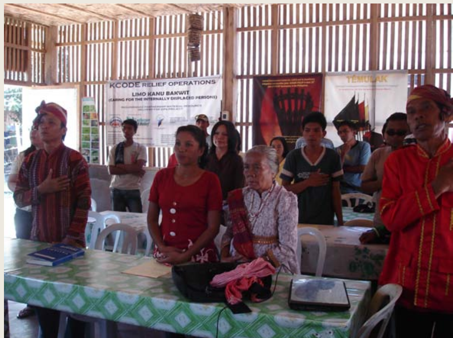
Photo taken during a Lumad community consultation in March 2010 in Barangay Tenorio, Datu Odin Sinsuat, Maguindanao.