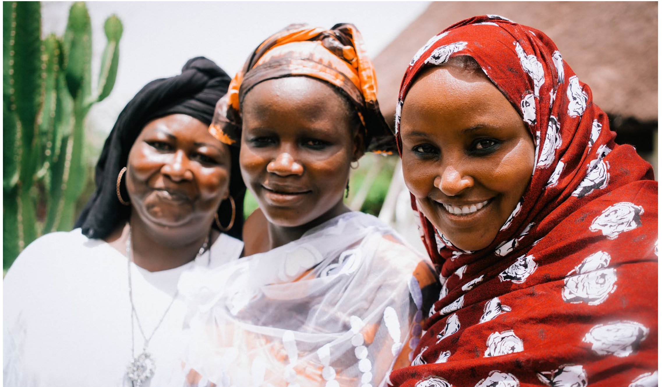
Agro-pastoral mediation in the Sahel. Beneficiaries of the project in Niger

MESU has developed similar thematic capacity and expertise in environmental peacemaking and organised crime and illicit economies. It has helped HD teams to design operational engagements in these areas, has linked HD with the expert community working on these issues and plans to collaborate with more HD teams in the near future.