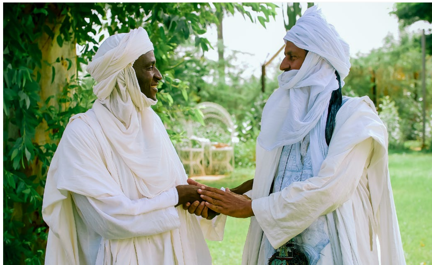
Community mediators in the Sahel region

HD's Mediation Support team (MESU) provides vital operational support with its technical and process design expertise, strategic planning, critical reviews of HD projects and the sharing of insights from projects with HD teams and the wider peacemaking community.