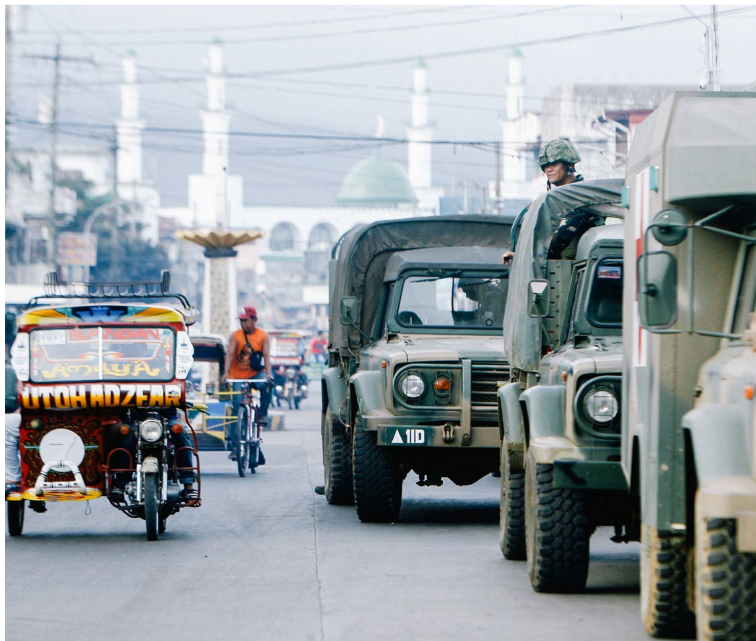
Philippine government troops in military vehicles conduct a patrol during the plebiscite on the Bangsamoro Organic Law in Jolo town, southern Philippines