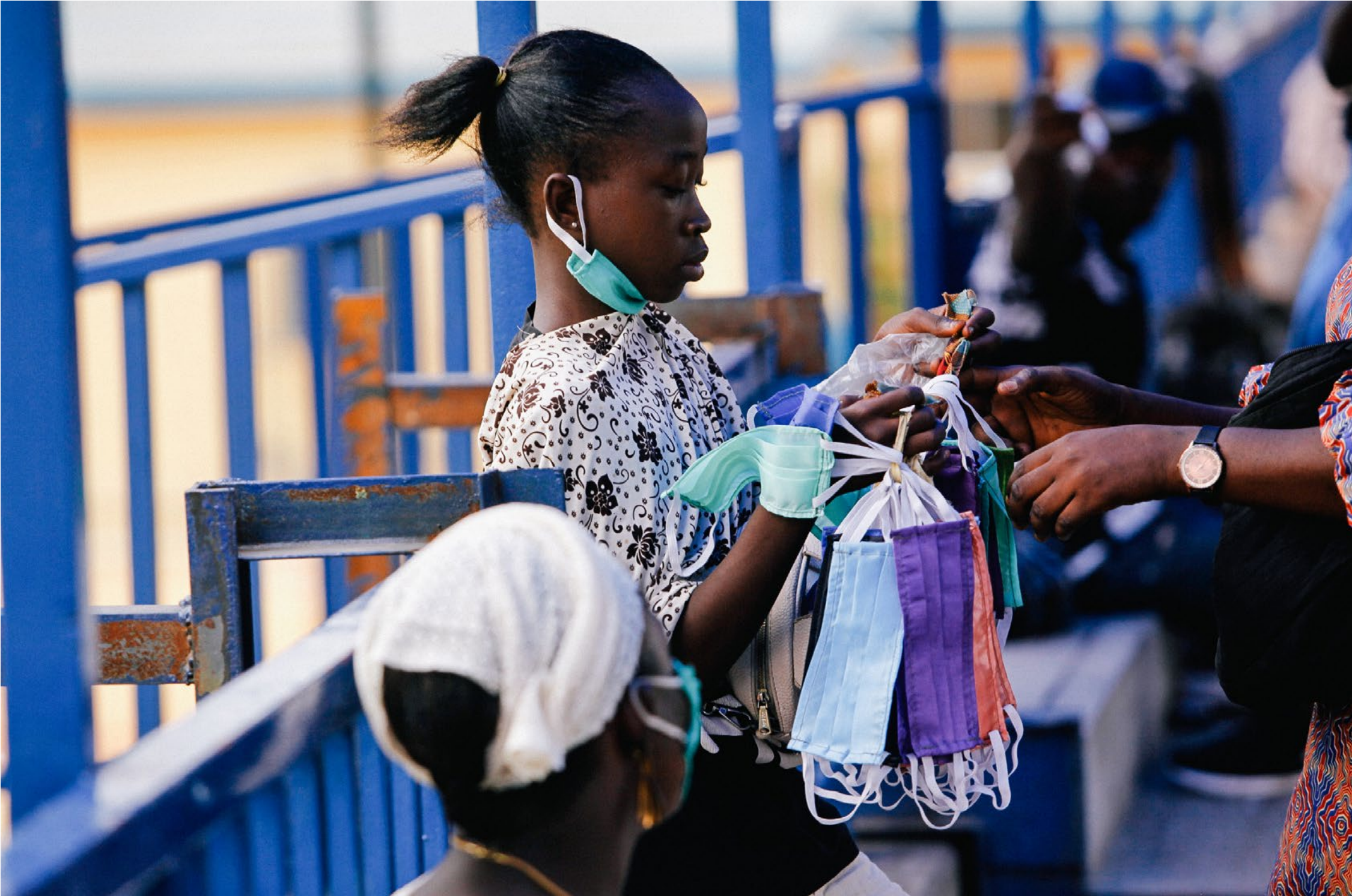
A girl sells locally made face masks on a pedestrian bridge in Ikeja district in Lagos, Nigeria

Peace proved more elusive in South Sudan where the formation of a unity government in February saw a decline in conflict between parties in the political process but an escalation in ferocious attacks on communities in the states.