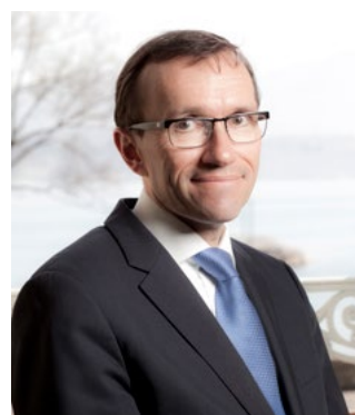
Espen Barth Eide Chair of the Board

HD welcomed Ambassador Karl Eikenberry and Margot Wallström in 2020 as new members of the board.