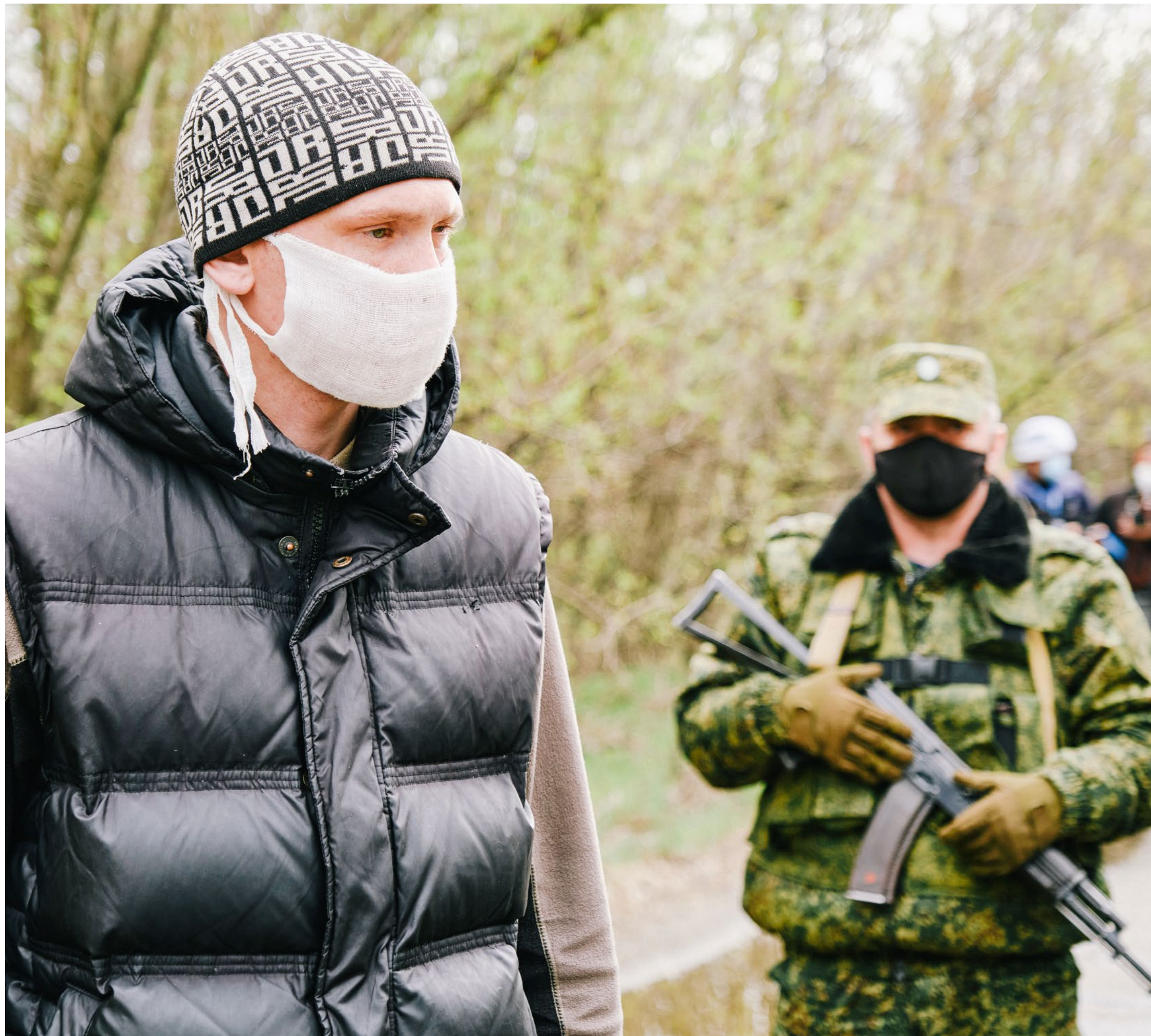
An exchanged Ukrainian prisoner walks during a prisoners swap between Ukrainian and pro-Russian militants' sides, near the pro-Russian militant-occupied town of Horlivka