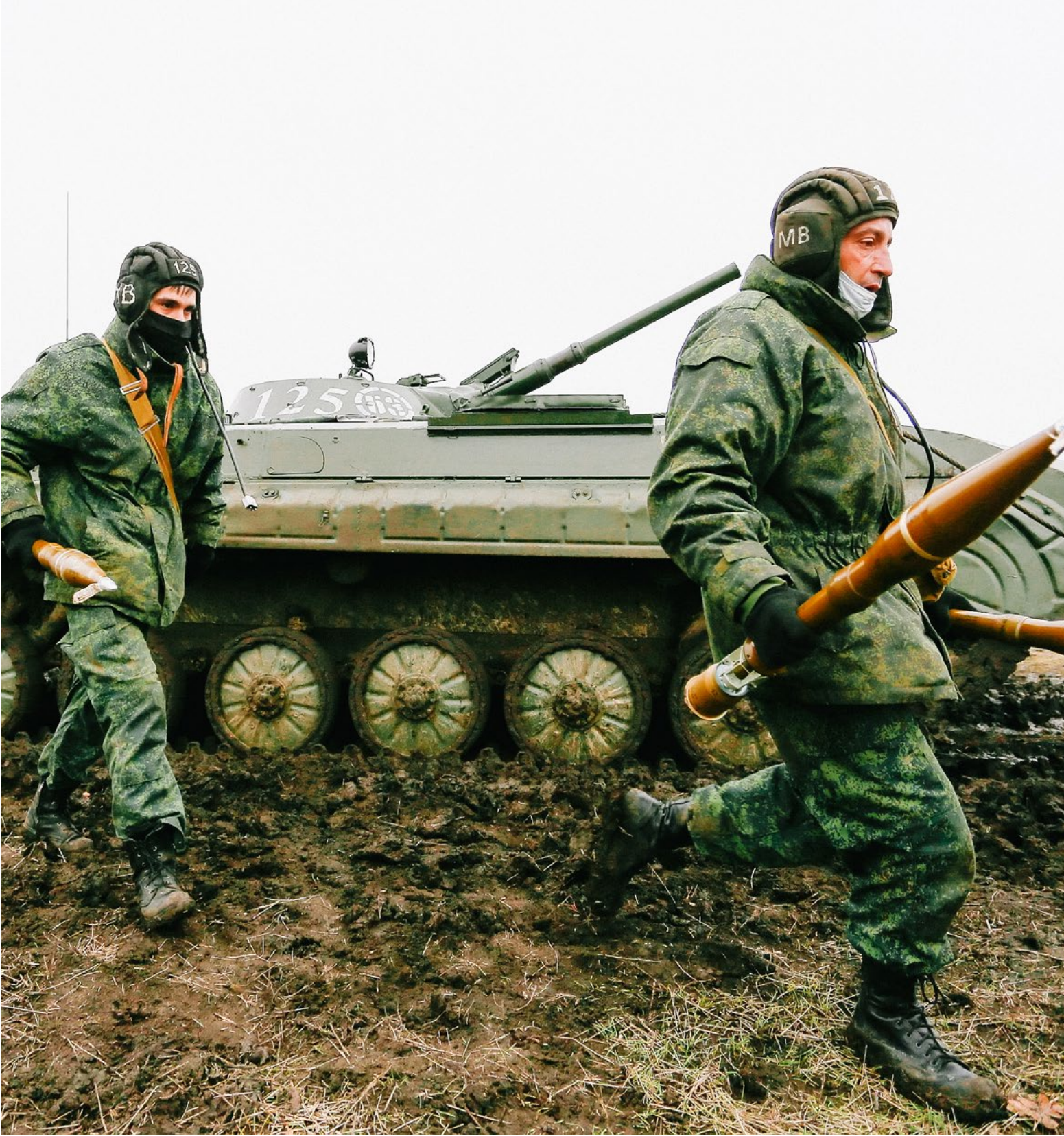
Pro-Russian militants of self-proclaimed Donetsk People’s Republic (DPR) operate during a military exercise

A Facebook page co-created by HD in Nigeria reached more than 2 million people with COVID information. More than half a million people accessed COVID information produced in five languages in Malaysia. Globally, more than 5 million people accessed HD’s COVID messaging on Facebook, with several hundred thousand liking or sharing what they found.