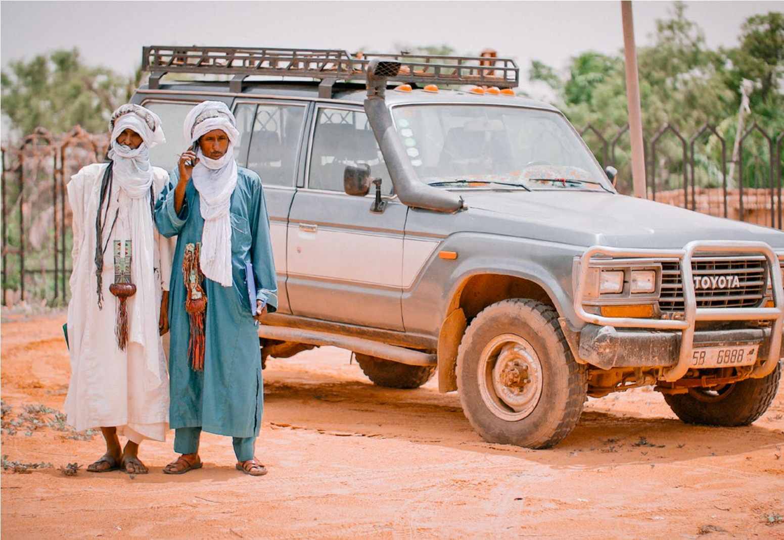
Agro-pastoral mediation in the Sahel - © HD

A military coup in Mali in 2020 underscored the fragility and turmoil surrounding the transition to a new government while also stalling HD's planned consultations on how to revive the 2015 Algiers Agreement. Still, HD was able to work with security management frameworks in the northern Timbuktu and Gao regions and mediate with armed groups in the Diré area.