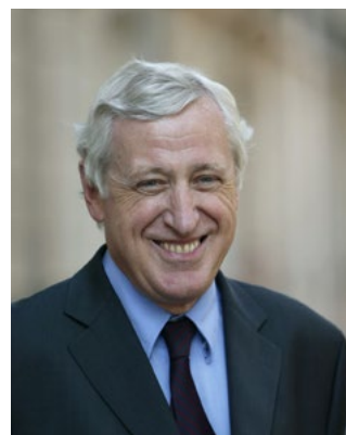
Ambassador Pierre Vimont Vice-Chair of the Board

Espen Barth Eide is a member of the Norwegian parliament, where he represents the Labour Party. Before his election in September 2017, Eide was the United Nations special advisor on Cyprus from 2014 to 2017, as well as managing director and a member of the managing board of the World Economic Forum in Geneva from 2014 to 2016. Between 2000 and 2013, he served as Norway's minister of foreign affairs, minister of defence, deputy minister of foreign affairs and deputy minister of defence. After joining HD's board in 2013, he became vice-chair in 2015 and chair in 2019.