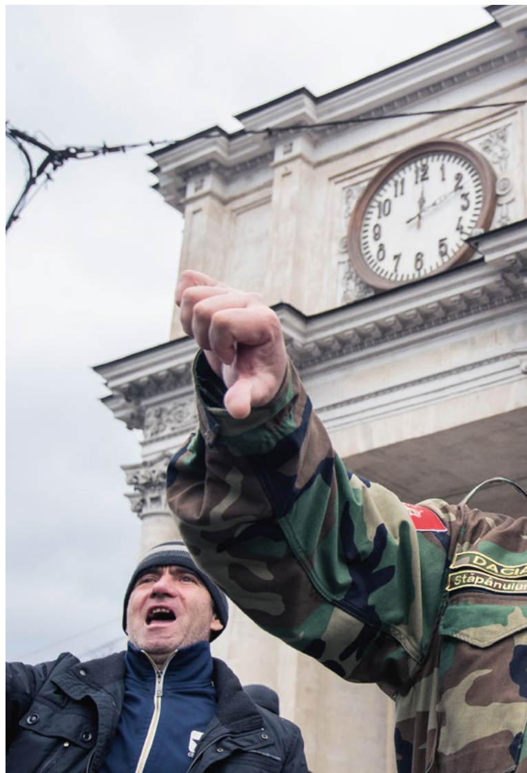
Photo: A veteran holding a mace shouts anti-government slogans during a protest of a group of war veterans in Moldova. © EPA-EFE / Dumitru Doru

papers commissioned from international experts that were shared with parties to the conflict and presented arguments that were reflected in public comments by policy makers. Following HD's long-standing dialogue efforts across the line of conflict, HD began to make progress in the areas of addressing ecological hazards, reconnecting economic links and developing reconciliation initiatives. In its ecological track, the participants established