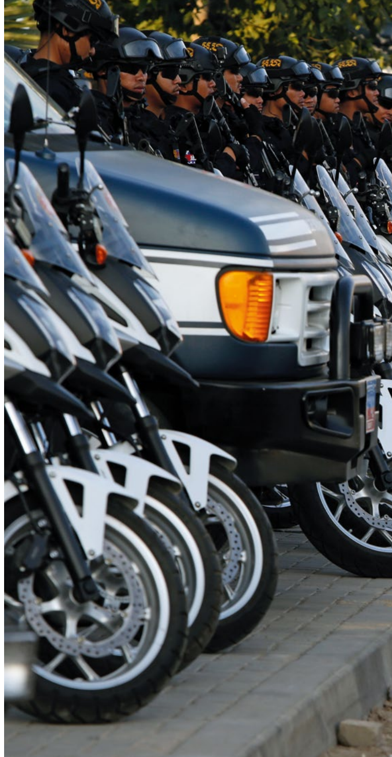
Photo: Cambodian police prepares for potential return of self-exiled opposition leader.

Meanwhile efforts to bring peace to the Philippines island of Mindanao reached a milestone in 2019 with the formal transfer of authority to the Bangsamoro Autonomous Region in Muslim Mindanao. This built on agreements between the government and Moro Islamic Liberation Front (MILF) and between the MILF and Moro National Liberation Front, bringing a drop in casualties and a rise in economic growth. However, risks of further conflict remain. HD, which provides technical support to the peace process helped the two Fronts finalise a common development plan and worked on creating formal and informal mechanisms