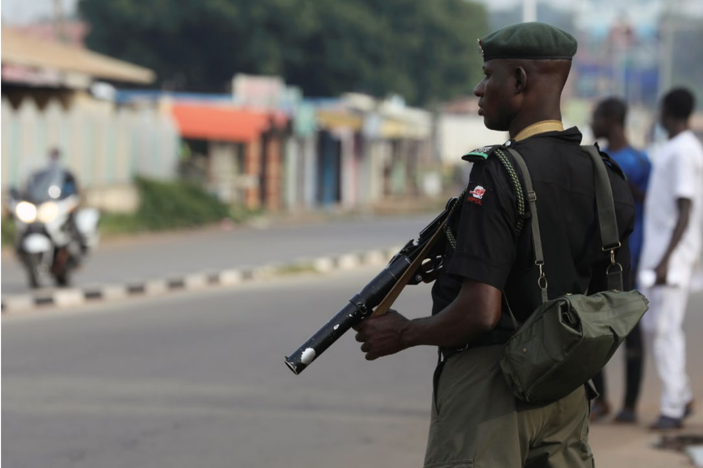
Photo: A member of security forces stands guard outside a court in the northern city of Kaduna.

HD aimed at ending local violence that claimed many lives and fueled hostility between Christian and Muslim communities. In the process of talks, HD negotiated humanitarian access to several prefectures enabling aid organisations to provide immunisation and other services in local communities.