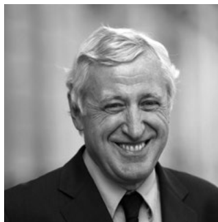
AMBASSADOR PIERRE VIMONT VICE-CHAIR OF THE BOARD

Mr Espen Barth Eide is a Member of the Norwegian Parliament where he represents the Labour Party. Prior to his election in September 2017, Mr Eide was United Nations Special Adviser on Cyprus from 2014 to 2017, as well as Managing Director and Member of the Managing Board of the World Economic Forum in Geneva from 2014 to 2016. He previously served as Norway's Minister of Foreign Affairs from 2012 to 2013. During his 10 years in the Norwegian government (2000-2001 and 2005-2013), he also held the positions of Minister of Defence, Deputy Minister of Foreign Affairs, and Deputy Minister of Defence. Before joining the government, Mr Eide was a senior researcher at the Norwegian Institute of International Affairs (NUPI) and also directed NUPI's Department of International Politics. He joined HD's Board in 2013, was Vice-Chair in 2015 and was appointed its Chair in 2019.