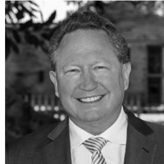
MR ANDREW FORREST GLOBAL PATRON

Dr Javier Solana was the Secretary-General of the Council of the European Union (EU) and High Representative for the EU's Common Foreign and Security Policy from 1999 to 2009, as well as Secretary-General of NATO from 1995 to 1999. Prior to that, Dr Solana was Spain's Minister for Foreign Affairs from 1992 to 1995. Dr Solana currently serves as President of the ESADEgeo-Center for Global Economy and Geopolitics, Distinguished Fellow in Foreign Policy at the Brookings Institution, Chairman of the Aspen Institute in Spain, Senior fellow at the Hertie School of Governance, and visiting Professor at the London School of Economics.