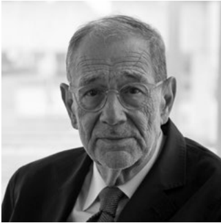
DR JAVIER SOLANA HONORARY PRESIDENT

Dr Javier Solana was the Secretary-General of the Council of the European Union (EU) and High Representative for the EU's Common Foreign and Security Policy from 1999 to 2009, as well as Secretary-General of NATO from 1995 to 1999. Prior to that, Dr Solana was Spain's Minister for Foreign Affairs from 1992 to 1995. Dr Solana currently serves as President of the ESADEgeo-Center for Global Economy and Geopolitics, Distinguished Fellow in Foreign Policy at the Brookings Institution, Chairman of the Aspen Institute in Spain, Senior fellow at the Hertie School of Governance, and visiting Professor at the London School of Economics.