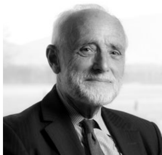
DR JAKOB KELLENBERGER BOARD MEMBER