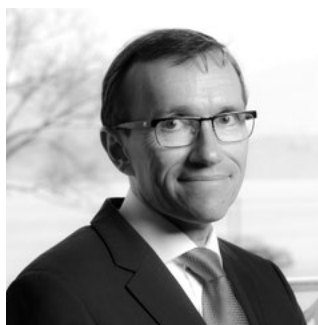
MR ESPEN BARTH EIDE CHAIR OF THE BOARD

Mr Espen Barth Eide is a Member of the Norwegian Parliament where he represents the Labour Party. Prior to his election in September 2017, Mr Eide was United Nations Special Adviser on Cyprus from 2014 to 2017, as well as Managing Director and Member of the Managing Board of the World Economic Forum in Geneva from 2014 to 2016. He previously served as Norway's Minister of Foreign Affairs from 2012 to 2013. During his 10 years in the Norwegian government (2000-2001 and 2005-2013), he also held the positions of Minister of Defence, Deputy Minister of Foreign Affairs, and Deputy Minister of Defence. Before joining the government, Mr Eide was a senior researcher at the Norwegian Institute of International Affairs (NUPI) and also directed NUPI's Department of International Politics. He joined HD's Board in 2013, was Vice-Chair in 2015 and was appointed its Chair in 2019.