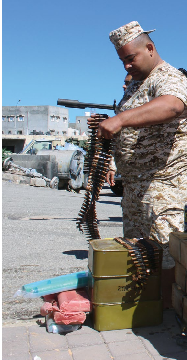
Photo: Militants, reportedly from the Misrata armed group, prepare their weapons and ammunition before heading to the frontline.

HD organised a conference in Anbar governorate attended by local Sunni communities and the Baghdad Operations Command, leading to opening of the Baghdad wall significantly easing movement and delivering immediate improvements in the quality of life. A second conference in Anbar in December produced agreement that allowed the resettlement of hundreds of families previously