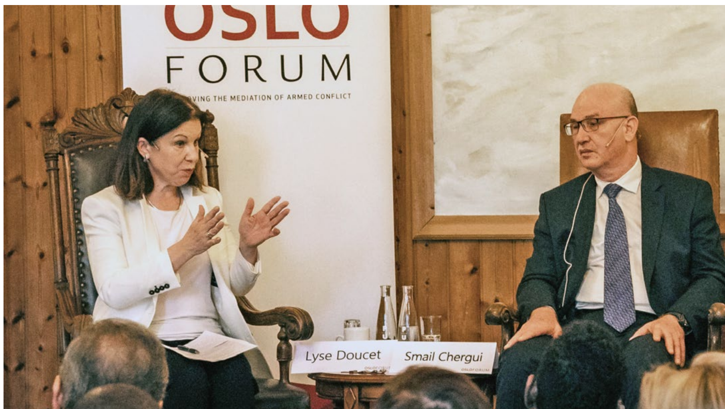
Photo: Lyse Doucet, Smail Chergui, Ine Eriksen Soreide and Anwar bin Mohammed Gargash at the Oslo Forum 2019.

HD and the UN Department of Political and Peacebuilding Affairs jointly launched a "Digital Mediation toolkit" examining the impact of digital technologies on mediation. A year-long exploratory study on multitrack approaches to peace processes conducted by HD, in partnership with swisspeace, CSS ETH Zurich and the