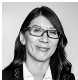
DR JOANNE LIU BOARD MEMBER

Dr Kellenberger was President of the International Committee of the Red Cross (ICRC) from 2000 to 2012. A former State Secretary for Foreign Affairs and Head of the Directorate of Political Affairs in the Swiss Foreign Ministry from 1992 to 1999, he has also served in Swiss embassies in Madrid, Brussels and London. Between 1984 and 1992, he headed up the Office for European Integration, serving first as a Minister and later as an Ambassador with responsibility for relations with the European Union and the European Free Trade Association. Dr Kellenberger teaches in the Law Faculty at the University of Salamanca in Spain. In addition to being a member of HD's Board since 2012, Dr Kellenberger is President of the Board of Swisspeace, an Honorary Member of the American Society of International Law, as well as a member of the Swiss Re Strategic Council. Dr Kellenberger was awarded the Grosses Verdienstkreuz mit Stern in 2012 and appointed Commandeur de la Légion d'Honneur in 2013.