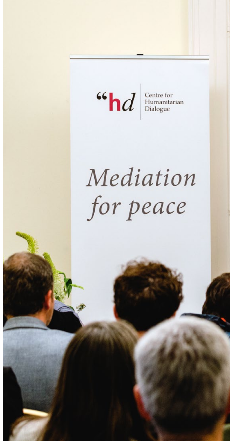
Photo: David Harland announces ETA's final declaration of disbandment.

To sustain efficiency in a rapidly evolving international context, HD has established six regional hubs covering Asia, Eurasia, Anglophone and Lusophone Africa, Francophone Africa, Latin America and the Middle East and North Africa. These hubs have the agility and capacity to respond rapidly to emerging conflict situations, and each maintains unique regional networks and deep knowledge of local contexts. They are supported by headquarters in Switzerland, providing executive oversight and corporate support.