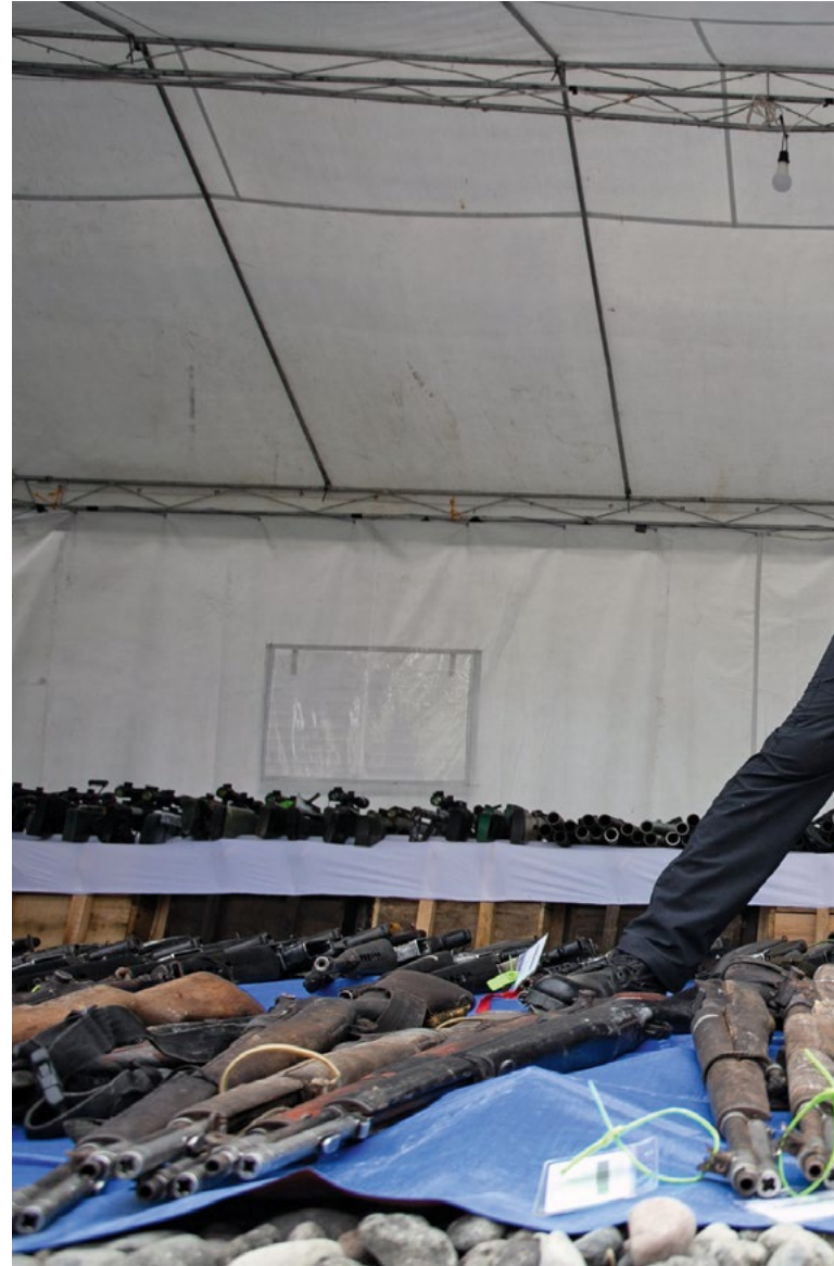
Photo: Rebels surrender firearms for Bangsamoro territory in Mindanao.

The diverse spectrum of agreements was indicative of changing conflict dynamics. Escalating regional and great power tensions also increase the obstacles of reaching comprehensive peace accords. Atomised conflicts and easy access, even for small groups, to potent new technologies and abundant supplies of