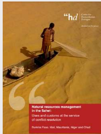
Natural resources management in the Sahel: Uses and customs at the service of conflict resolution