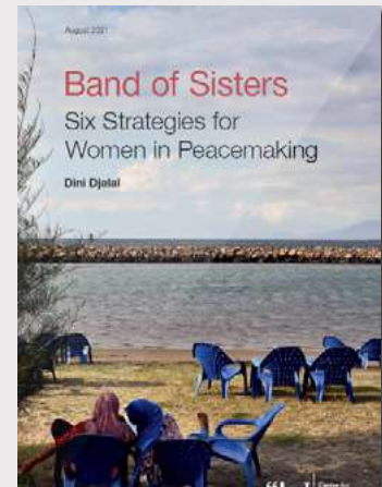
Band of sisters: Six strategies for women in peacemaking