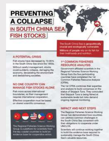
Preventing a collapse in South China sea fish stocks

For more on HD's work — and all of our news and insights — please visit