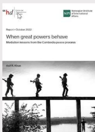
When great powers behave: Mediation lessons from the Cambodia peace process